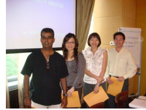
First FMP Graduates in Singapore